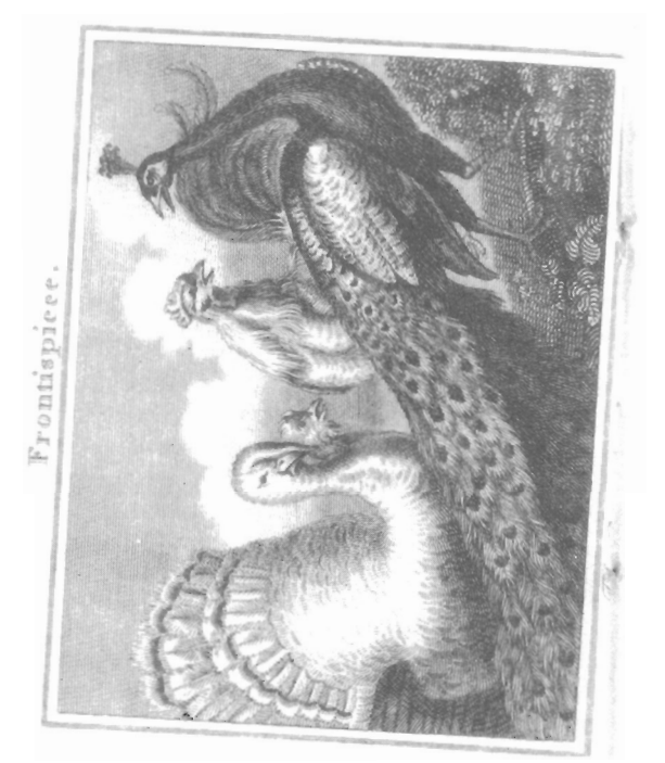
Figure 1. An early chapbook edition of Butterfly's Ball and Grasshopper's Feast . London: Dean and Munday, [ca. 1815]. By William Roscoe.

PEACOCK "AT HOME: SEQUE TO THE BUTTERFLY'S BALL WRITTEN BY A LADY. AND ILLUSTRATED WITH ELEGANT ENGRAVINGS. LONDON: FRINTED FOR J. HARRIS, SUCCESSOR TO E. NEWBERY AT THE BRIGHNAL JUVENILE LIBRARY, THE CORNER OF ALL PAUL'S CHURCH-YARR. 1808.