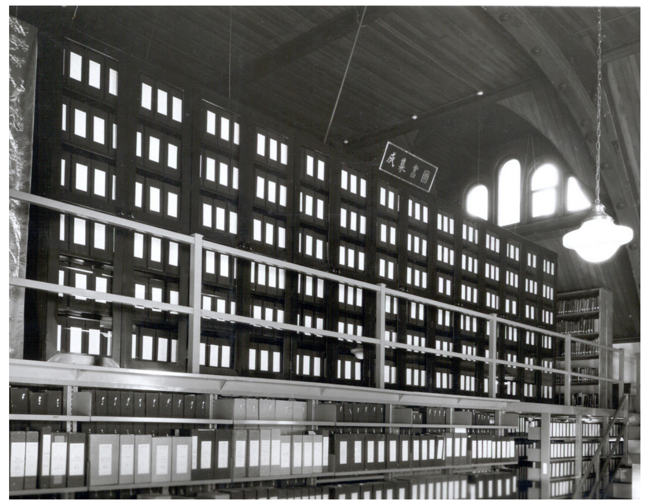
Figure 4. Gest Chinese Research Library, Redpath Library, McGill University, 1931.