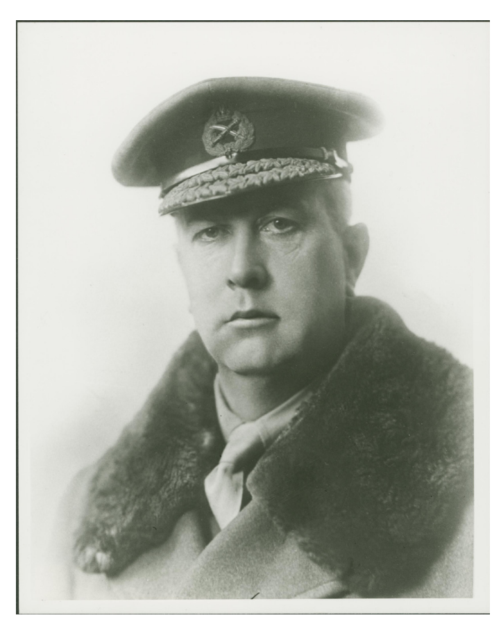
Figure 1. Portrait of Sir Arthur Currie. Black and white photographic print, 1917.

Currie, who had witnessed first-hand the horrors of combat, detested war. He believed that "War is not a means to establish peace. It is a delusion and a lie".7 He hoped war would not happen again, and he tried to find ways to maintain peace. He strongly believed that after World War I European domination of the world would be diminished and the status of other regions, especially Asia, would increase. He felt, however, that people in the West lacked knowledge and understanding of people in the Far East, and China in particular. He believed that universities should provide courses in area studies, such as Chinese studies. In his letter of 1932 to the Secretary-General of the League of Nations in Geneva, Currie said: "Believing, as we all do, that intellectual co-operation and mutual understanding contribute largely to international peace, we felt that such a development might in the end have a value apart from its cultural importance."8 He thought that the time was ripe for such a development in Canada. He found that occidental nations were realizing more and more fully the historical and cultural connection