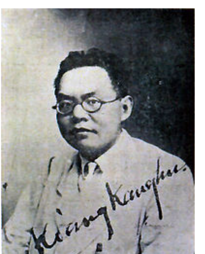
Figure 6. Kiang 's calligraphy. Picture from website of Baidu: http://baike. baidu.com/view/477462.htm. Accessed December 17, 2011