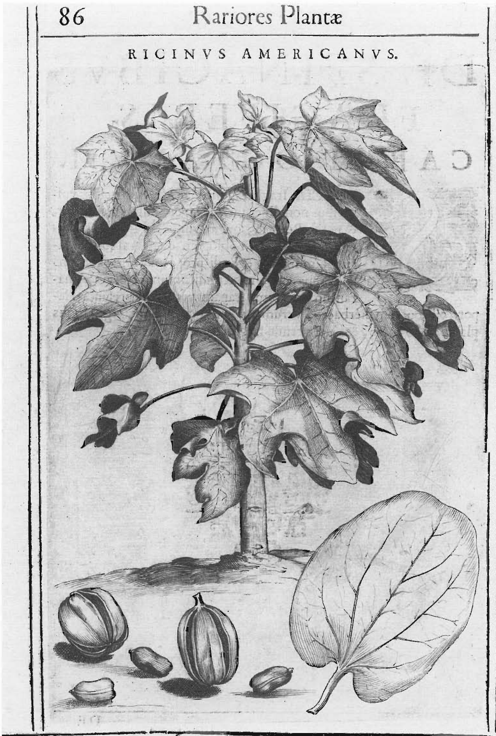
Figure 1. "Ricinus Americanus."