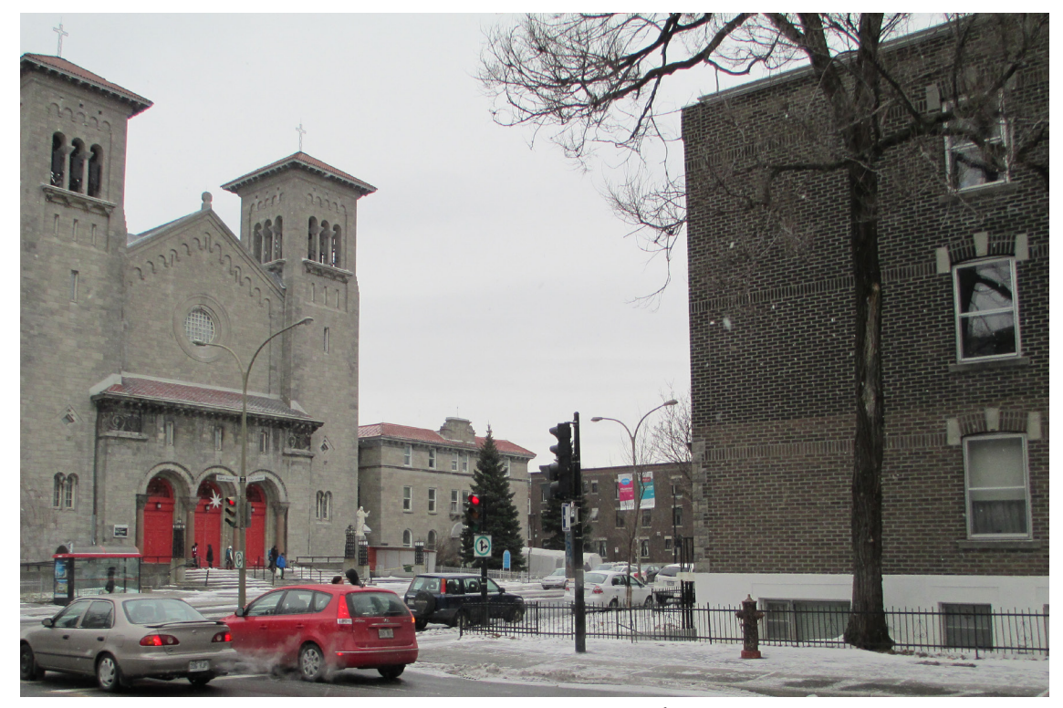
Figure 4. Messac apartment (R), 2045 St-Joseph E., Montreal, opposite Église St-Pierre-Claver, photographer Robert Michel, 2012