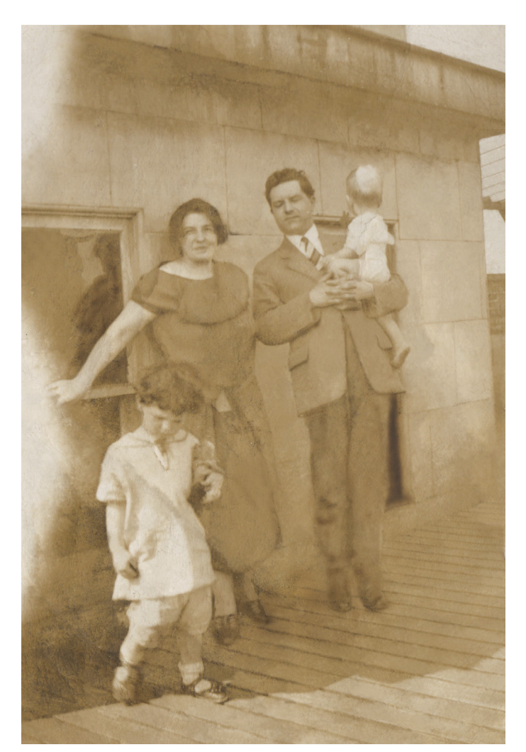
Figure 1. The Messac family in Montreal, ca. 1925, photographer unknown, courtesy O. Messac, Paris

fiction: Le 'Detective Novel' (published 1929). Messac is best known for his science fiction dystopias Quinzinzinzili (1935), La Cité des asphyxiés (1937) and Valcrétin (posthumously, 1973). He has been rediscovered and republished. Many inédits—essays, novels, and letters are being published for the first time, opening a new window on the tormented decades between the World Wars.<sup>4</sup> The Société des amis de Régis Messac publishes a journal, Quinzinzinzili: l'univers messacquien and a collection of studies, Régis Messac: un écrivain journaliste à reconnaître appeared in 2011.5 Examined here are 1) Messac's teaching of French at McGill, 1924-1929, and 2) Messac's satirical autobiographical novel about his alter ego André Pluche's teaching French at Smith Conundrum University the same years. So many of the novel's characters and episodes resemble real life professors and events that one is tempted to read the novel as a memoir or roman à clef. But it is also a roman à thèse: Smith Conundrum University is mediocre. Though it is disguised as an American university, we recognize a negative, surreal version of McGill. The novel targeted students indifferent to learning; pompous, incompetent professors; snobbery; religion; Prohibition, Puritanism, militarism, and American-style quantitative