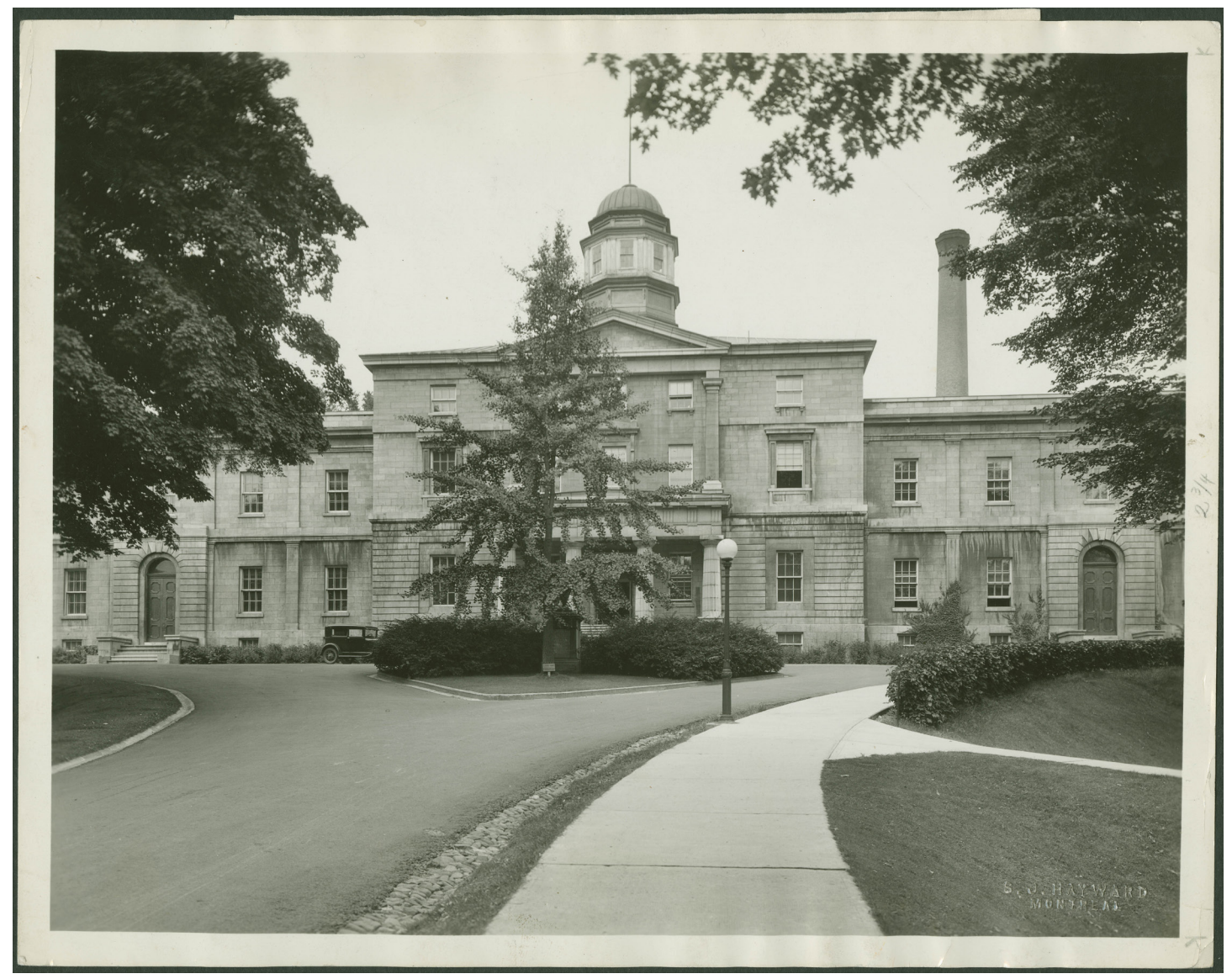
Figure 3. Arts Building, 1929, photographer S.J. Hayward, MUA PR026608

introductory and advanced language and literature courses. He was often paired with the department head du Roure, an indication of his importance. Courses and content varied by year; the following summarizes Messac's teaching. Messac and others, including du Roure, taught French Language First Year-three one hour lectures per week. The course included composition, French history texts, Dumas, Racine, Merimee, and Moliere's Le Bourgeois Gentilhomme. Similarly, Messac with others taught sections of Second Year language and literature courses; included were a variety of works such as Moliere's Les précieuses ridicules, Émile Augier, Le Gendre de M. Poirier, La Fontaine, Fables, as well as the recent romance about rural Quebec, Louis Hémon's Marie Chapdelaine. In 1926–1927 Messac taught fourth year students earlier 19thcentury French literature, including Chateabriand and Balzac, and (presumably for translations) the recent best seller of du Roure's friend Stephen Leacock, My Discovery of England (1922). Other French courses also used My Discovery. With du Roure Messac taught Gil Blas, selections from Rousseau