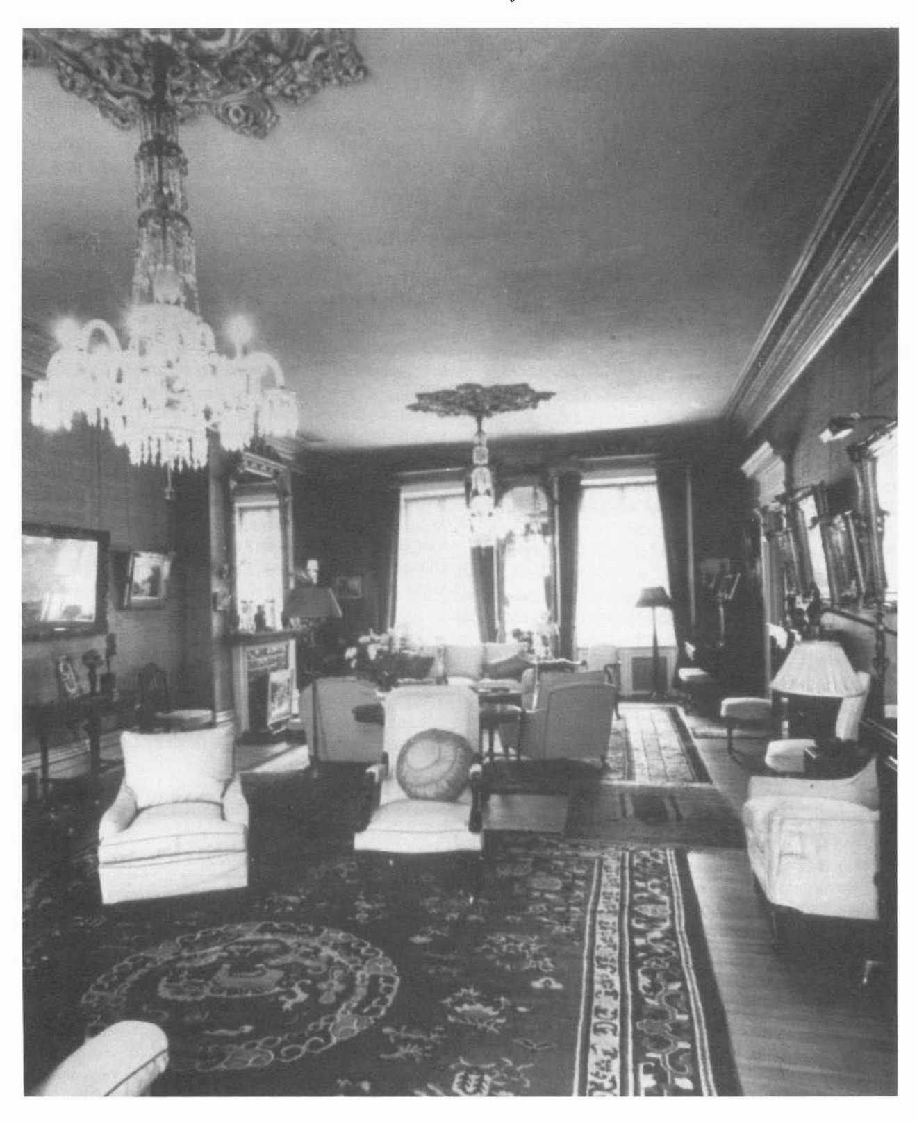
Living Room, Macdonald's house in Prince of Wales Terrace, n.d.