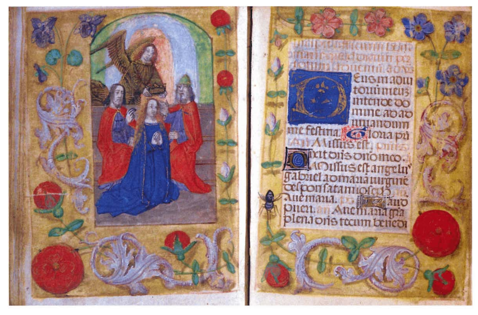
Figure 9. Coronation of the Virgin, tempera and gold on vellum.