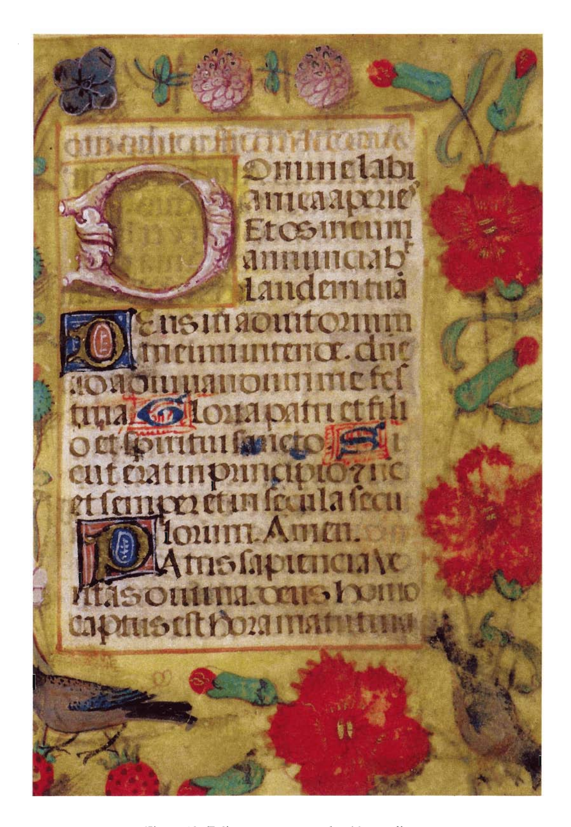
Figure 10. Folio 13<sup>r</sup>, tempera and gold on vellum.