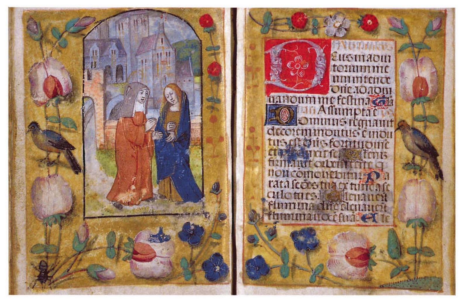
Figure 8. The Visitation, tempera and gold on vellum.