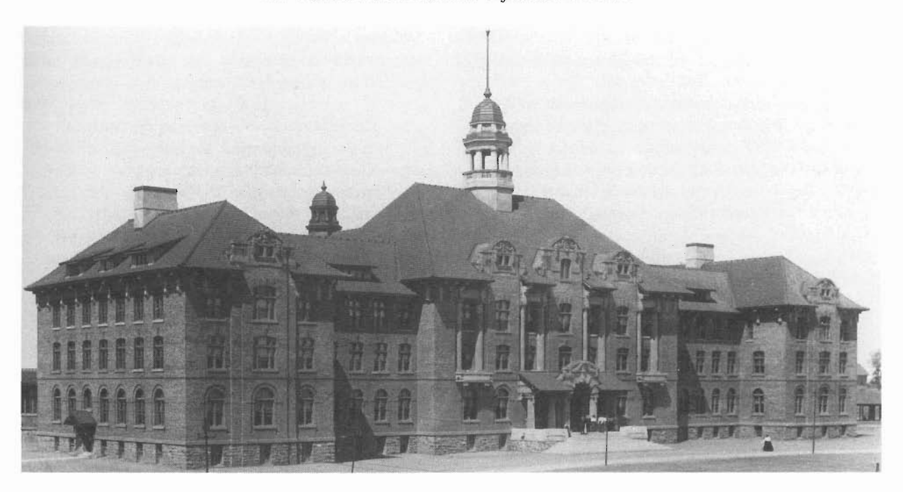
Macdonald College, Main Building, ca. 1910?