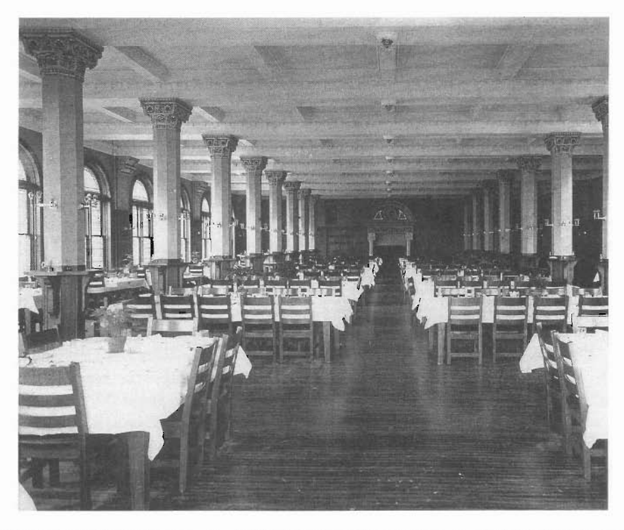
Macdonald College Dining Room, ca. 1910?