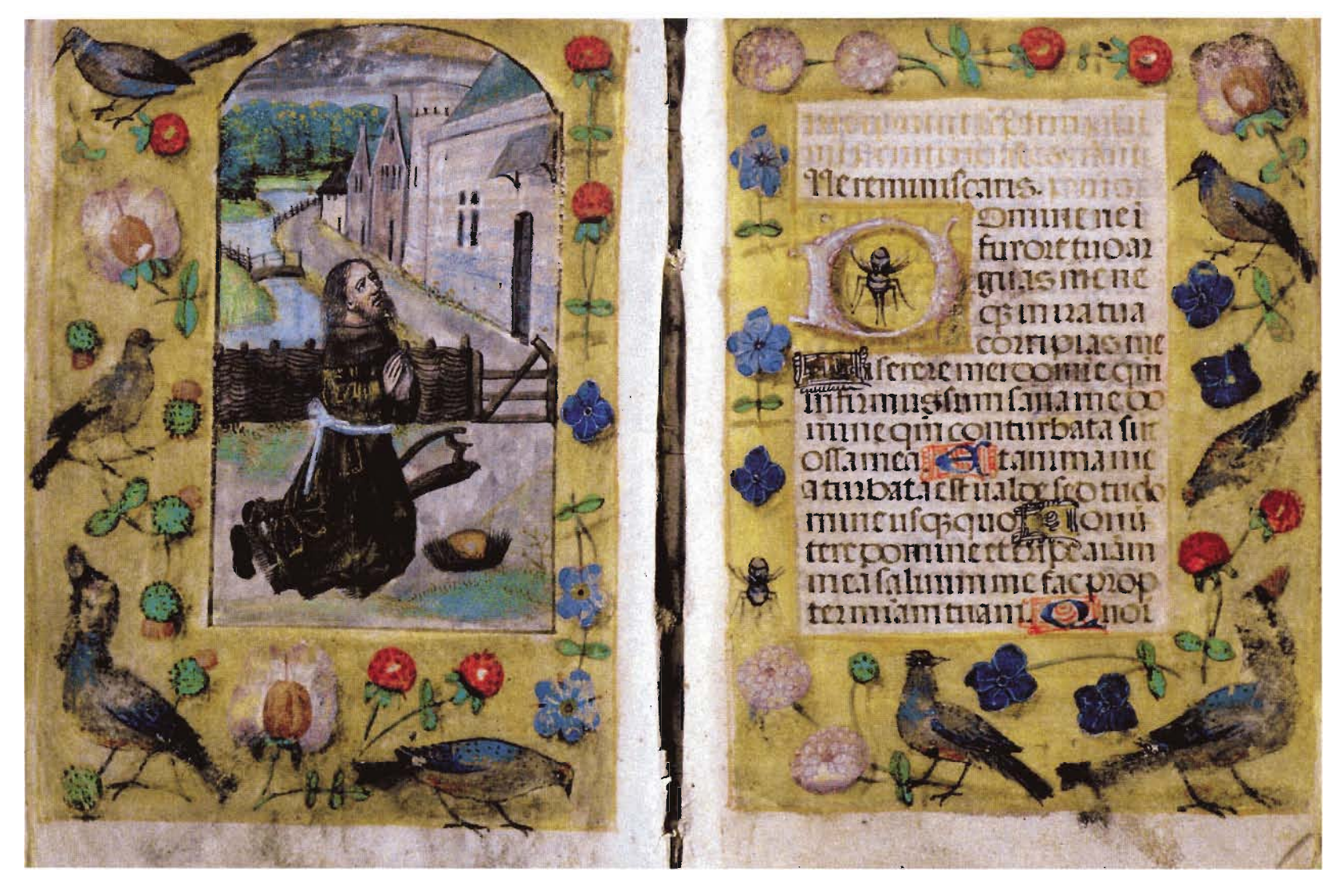
Figure 3. David in Penitence, tempera and gold on vellum.