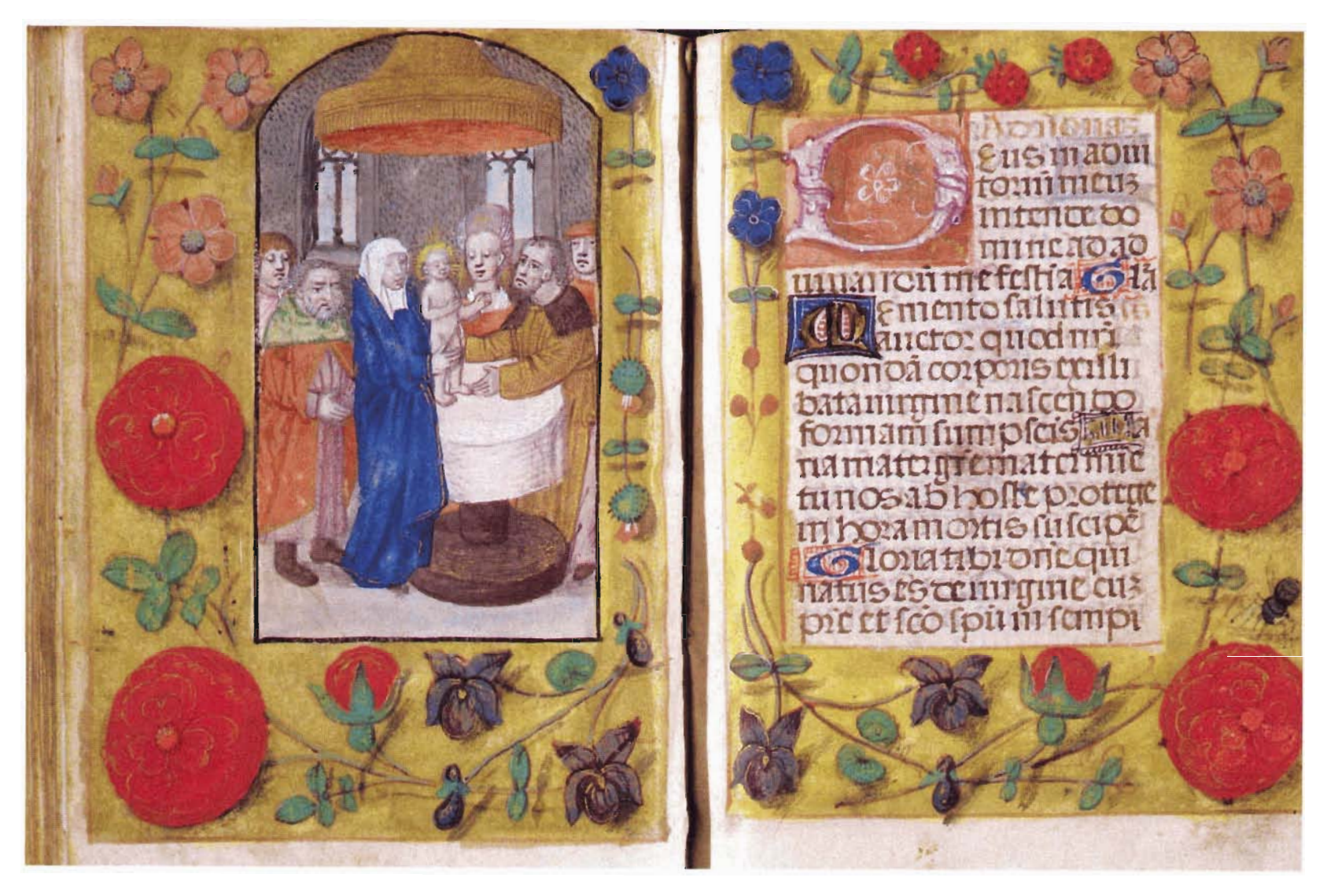
Figure 4. Presentation in the Temple, tempera and gold on vellum.