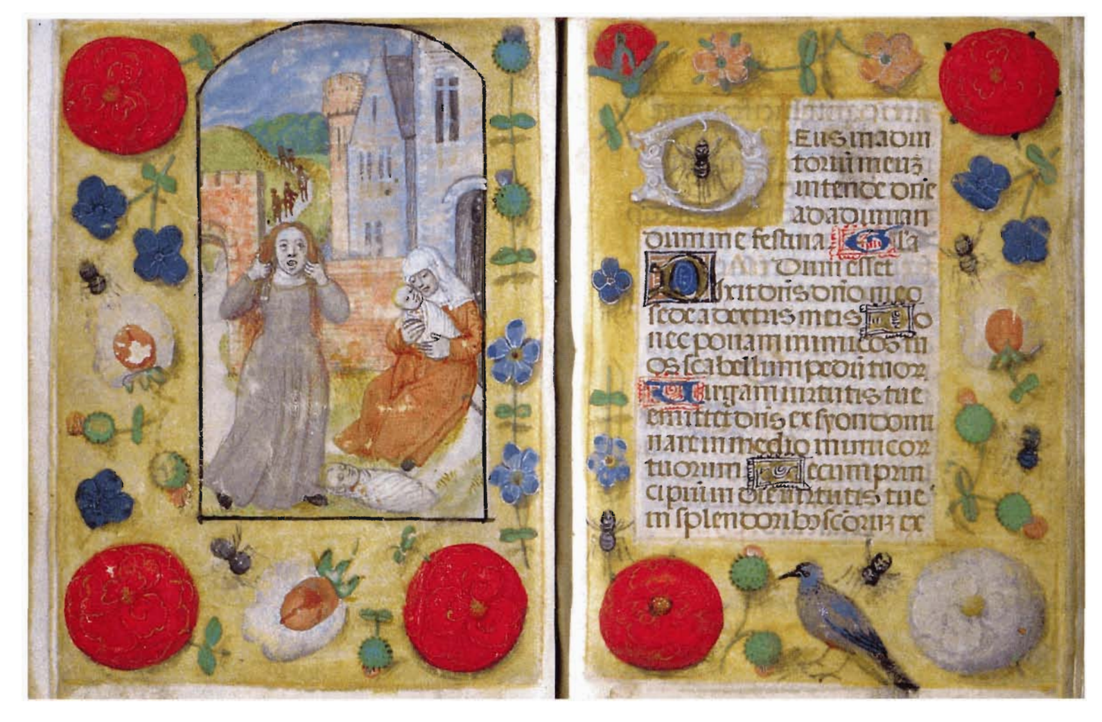
Figure 7. Massacre of the Innocents, tempera and gold on vellum.