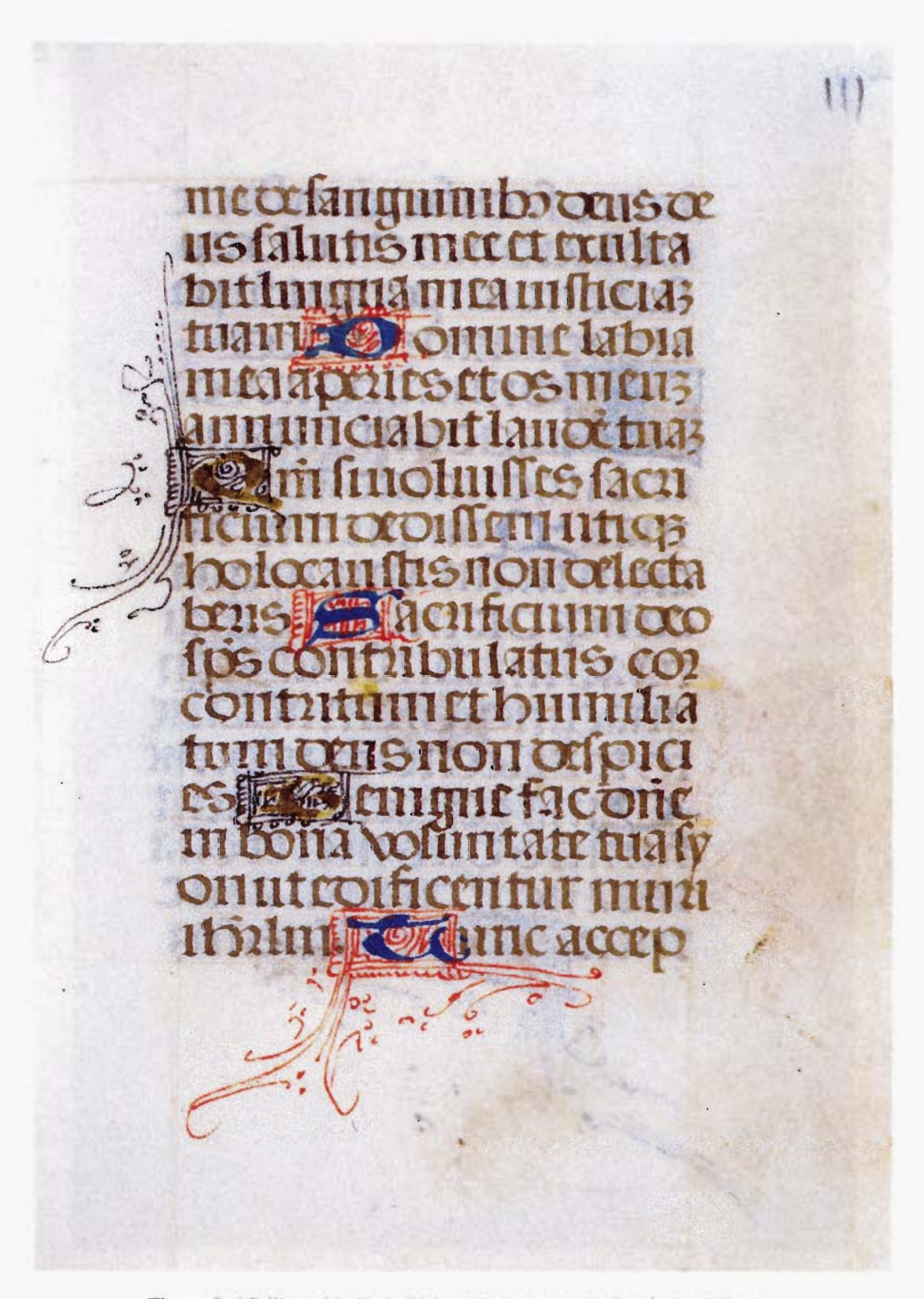
Figure 5. 'Calligraphic Embellishments,' tempera and gold on vellum.