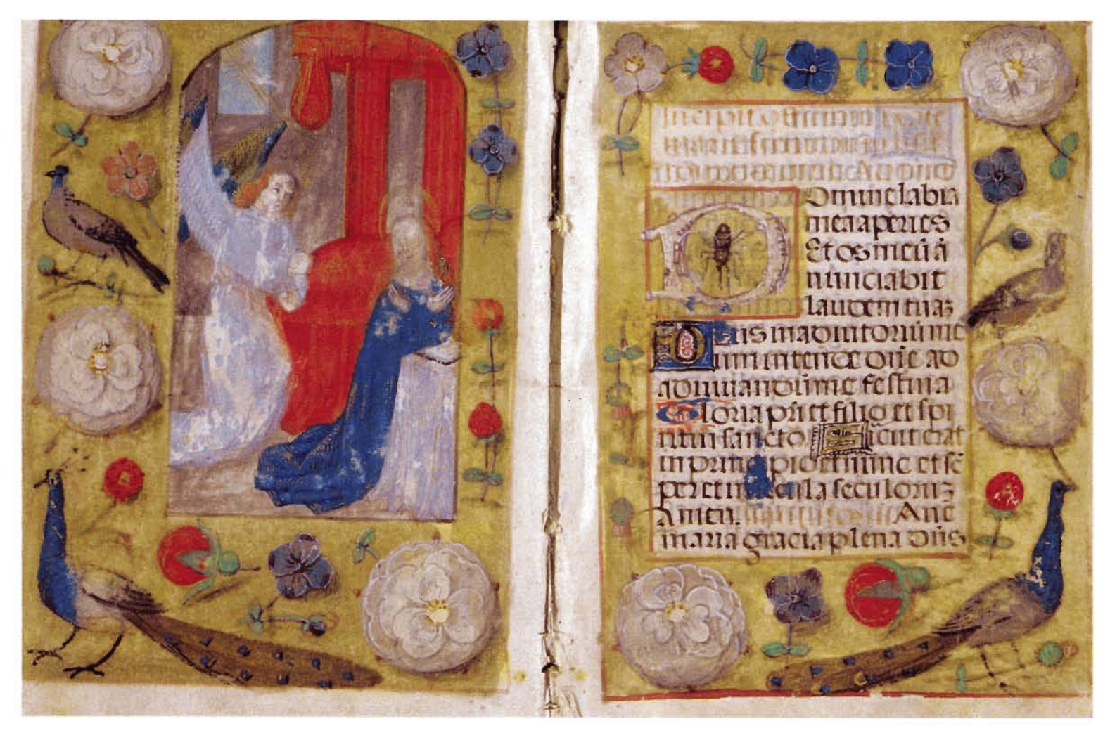
Figure 6. The Annunciation, tempera and gold on vellum.