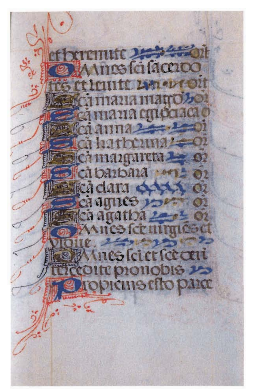
Figure 1. Litany to the Saints, gold and black, red and blue ink on vellum.