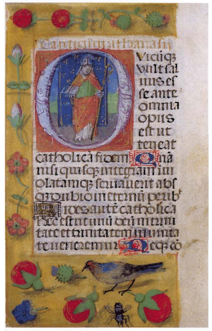
Figure 2. 'Historical Capital' with St. Athanasius, tempera and gold on vellum.