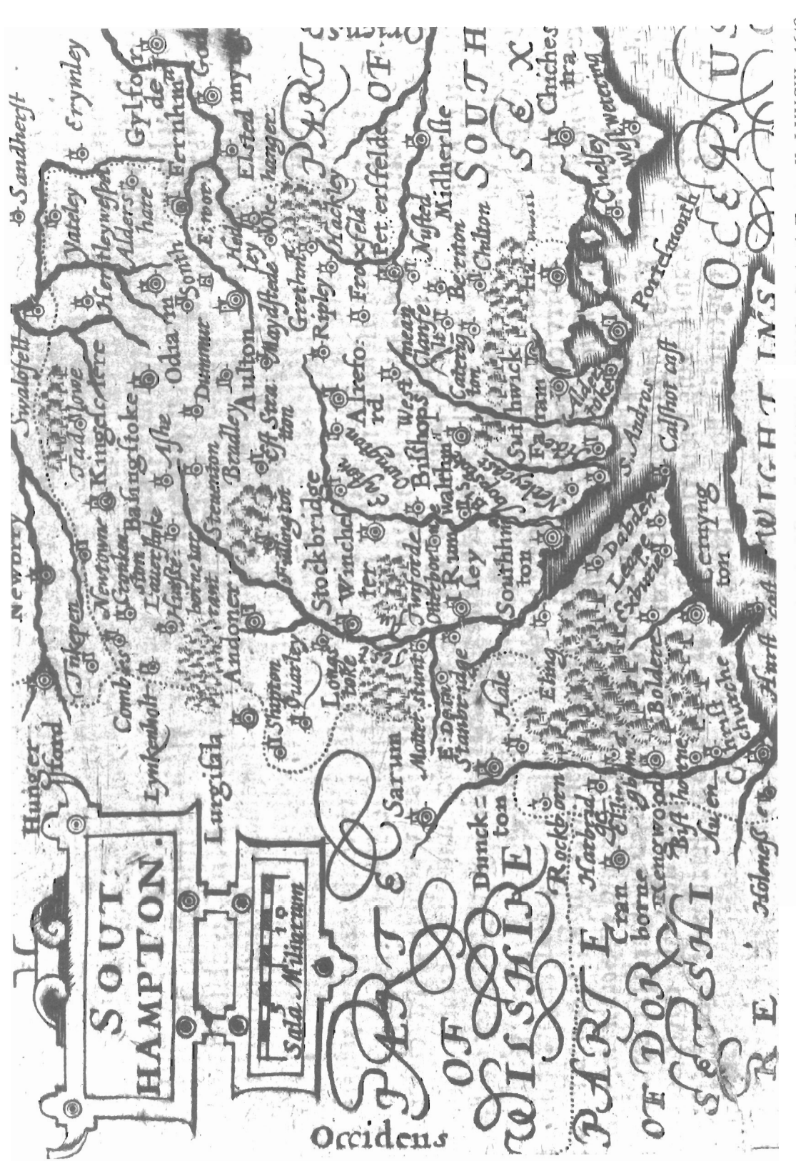
Southampton (Hampshire) from John Speed's England Wales Scotland and Ireland Described (1627 but 1646?). Redpath Tracts, II, LXXCIII, 1649.