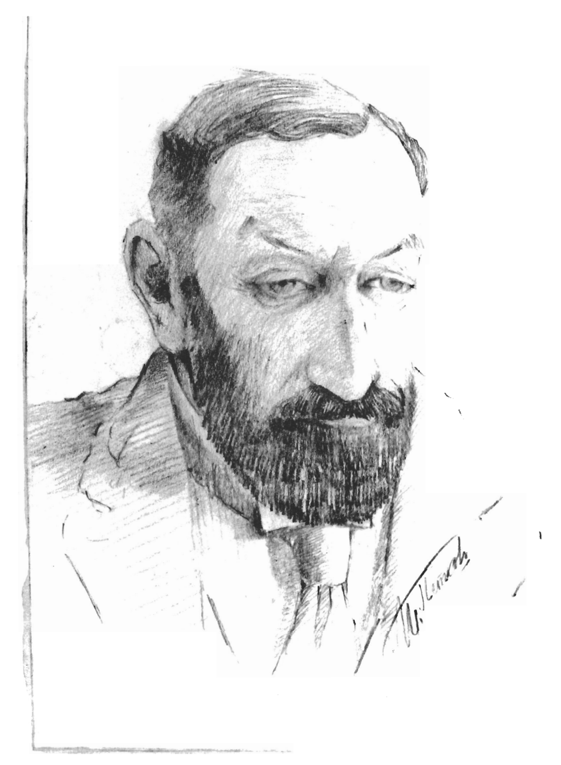
Figure 1. A portrait, in pencil, of Noel Buxton after he grew his beard to hide the scar from the assassination attempt. (Noel Buxton Papers.)