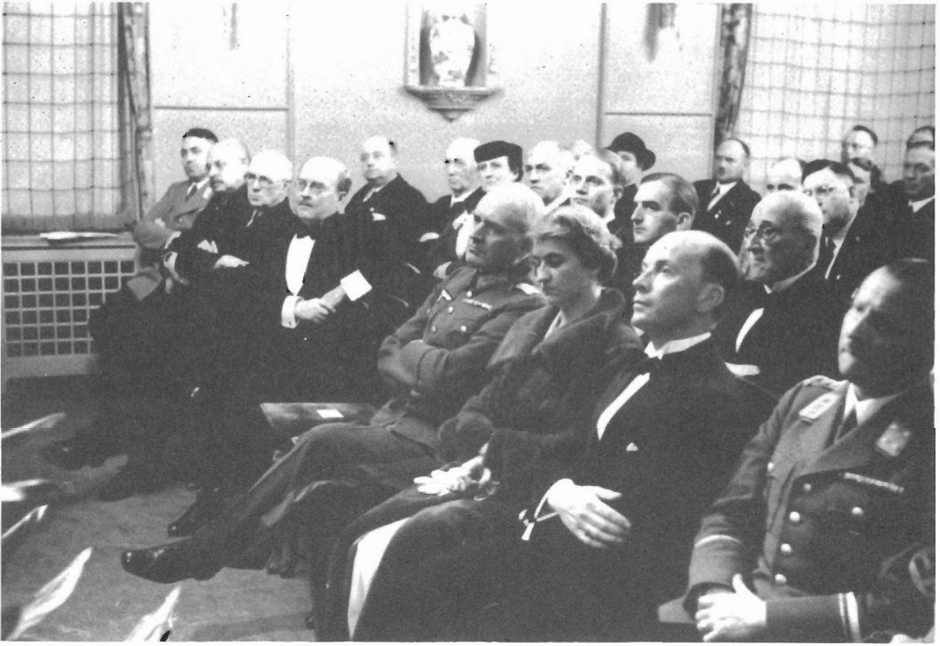
Figure 5. Lord Noel-Buxton addressing an audience at Stuttgart in 1938. (Noel Buxton Papers.)