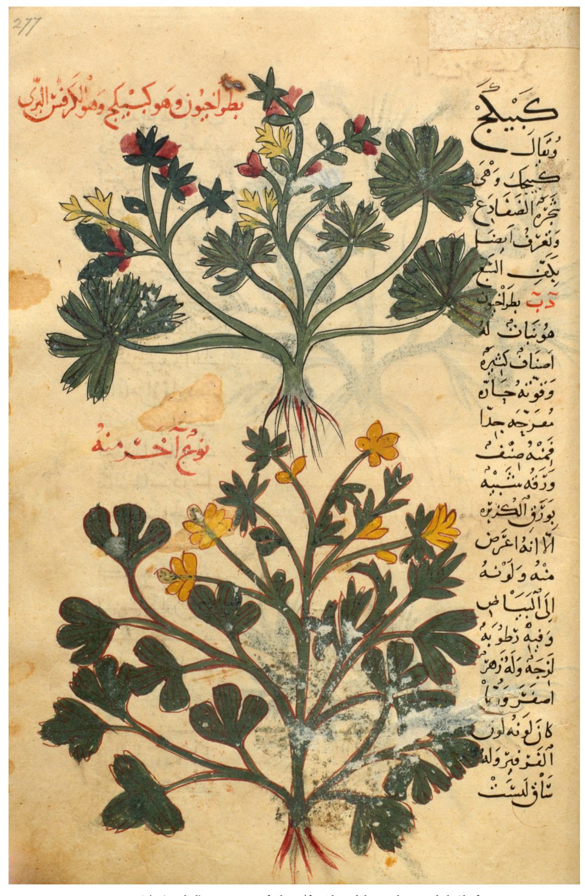
Figure 2. The 'Herbal' manuscript of Abū Ja'far Aḥmad ibn Muḥammad al-Ghāfiq \tilde{\mathbf{q}}