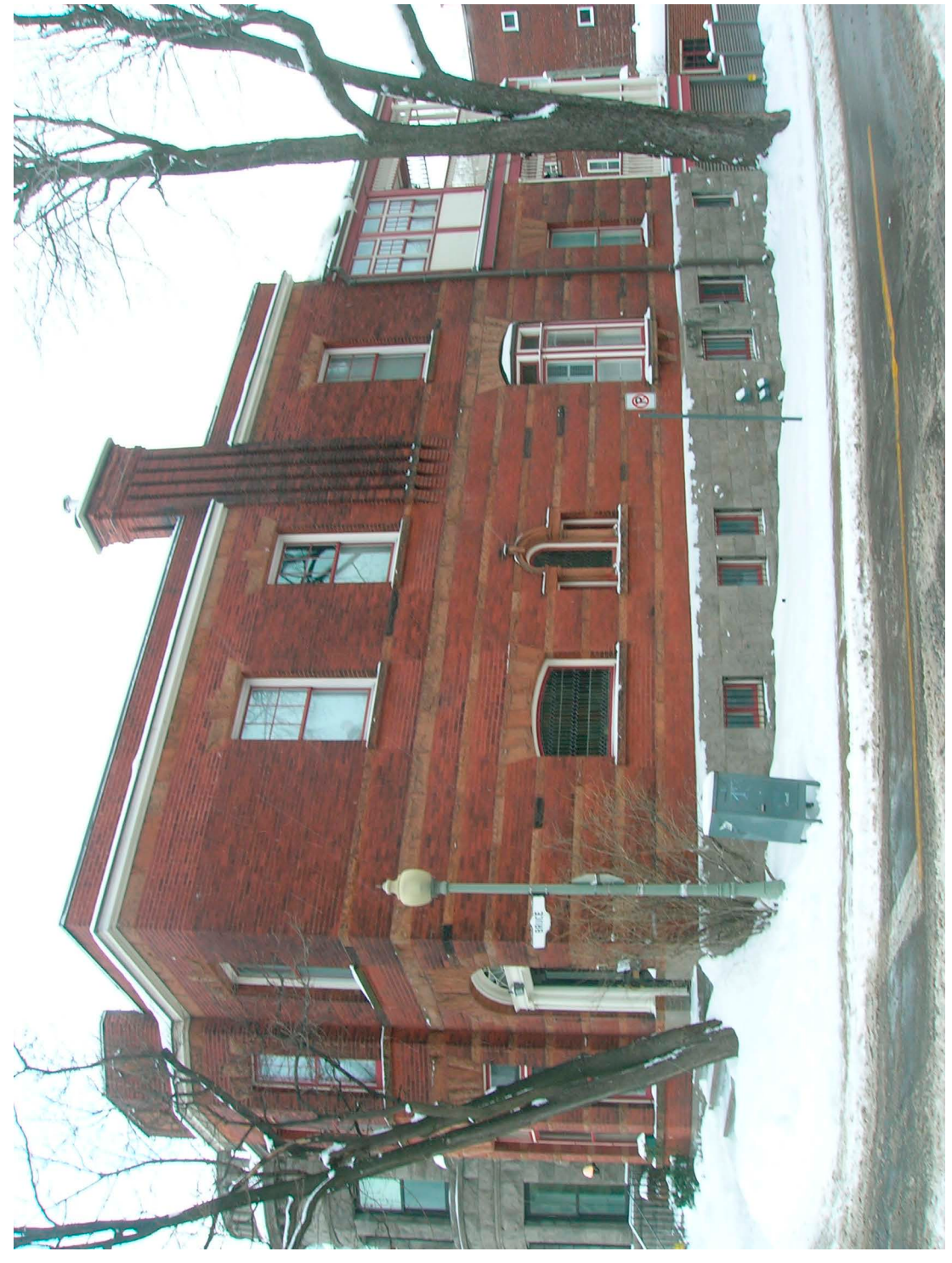
Figure 5. Levine lived in a basement room here, 4274 Dorchester Blvd. West, Montreal in 1947-48.