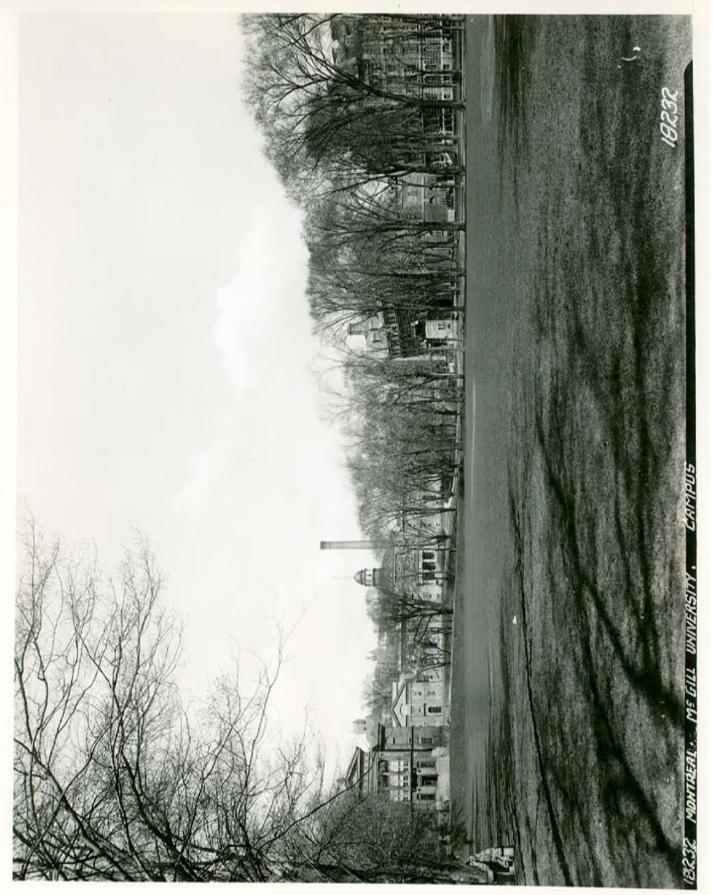
Figure 2. McGill lower campus, with shadows of trees, ca. 1920. McGill University Archives, PR002674.