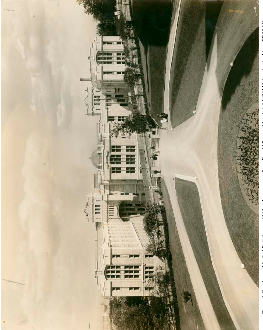
Figure 6. Strathcona Medical Building, ca. 1918 or later, as seen from Royal Victoria Hospital. McGill University Archives, PR026484.